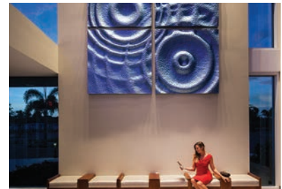
MGA Sculpture Studio / "Ripple Effect" / Cast Fiberglass/ Polyester Resin