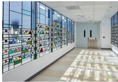
Arthur Stern / "The Street and Hills" / Glass Installation