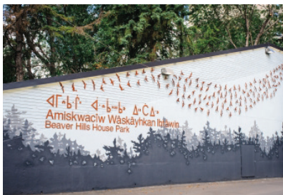
Destiny Swiderski / Beaver Hills House Park / Wayfinding