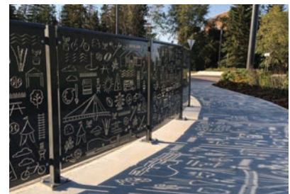
Terolenn Mykitiuk / St. Anne Street Decorative Fence