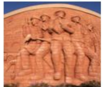
Public Art: Glendale, Arizona