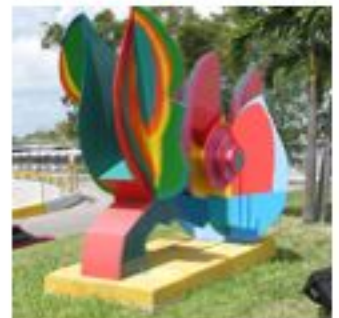
Public Art: Miami, Florida