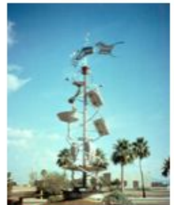
Public Art: Phoenix, Arizona